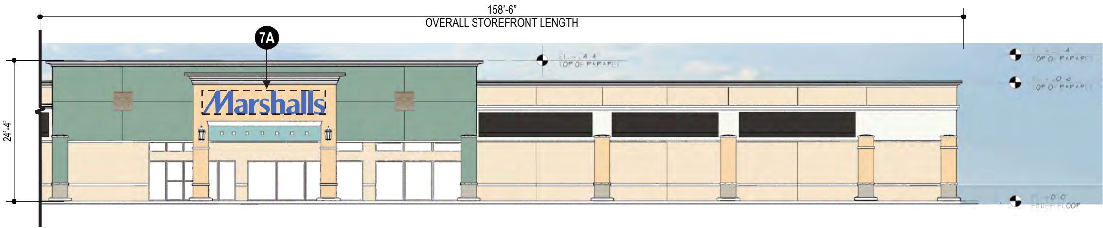
7A SOUTH EXTERIOR ELEVATION SCALE: 1/16" = 1'-0"